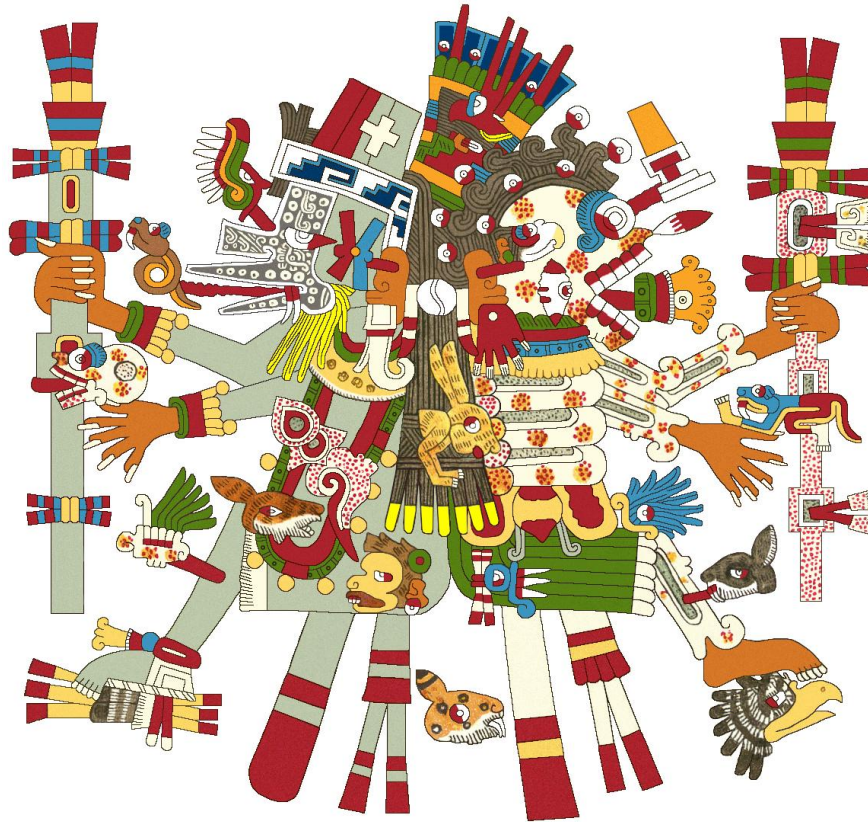
Ehecatl & Mictlantecuhtli, C. Borgia, plate 73

This composition the two figures backed up to each other can be seen in a number of the codices, though sometimes in reverse. The order of the 20 day-signs ( tonalli ) associated with each body part is fairly standard. Here the exaggerated day-sign Ehecatl hovers in the headdress, relating to the head/skull/brain. The day-sign Ocelotl (Jaguar) below and between the gods probably associates with the spine or torso. Most remarkable are the elegant conch-shell pendant and the unusual design of Ehecatl's ornate mask.