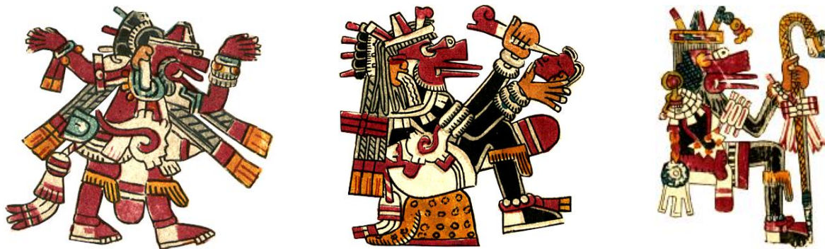
C. Vaticanus B

The same identifiers can be seen in Ehecatl images from Codex Vaticanus B (#3773), including a questionable eye-gouging operation. The consistency of motifs is remarkable.